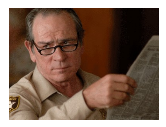
Aaaaaaand that's all I have to say about that.