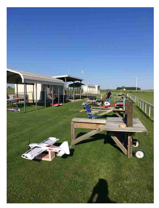
There were actually 7 of us Club members at the field on this sunny morning!