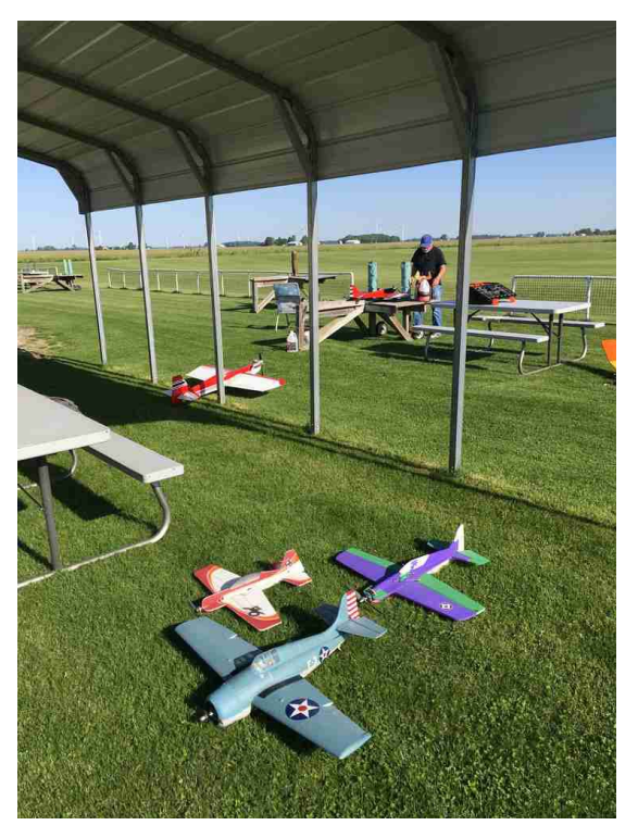
The electric powered half of my fleet