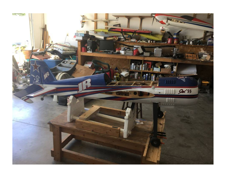
Tamas's Workshop of Wonders